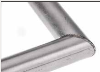
Weld seam for tube corner joint