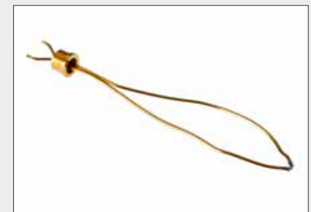
Manufacturing of temperature sensors (Illustration shows gilded platinum sensor)