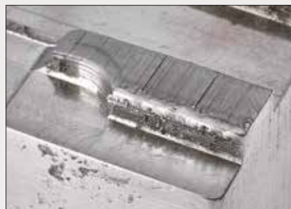
Weld cladding of edges