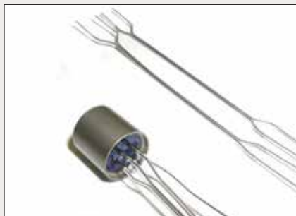
Fine welding of electronic components, e.g., thermocouples