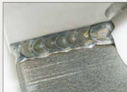
Welded joints of different materials