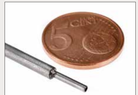
Tight welding of pressure lines